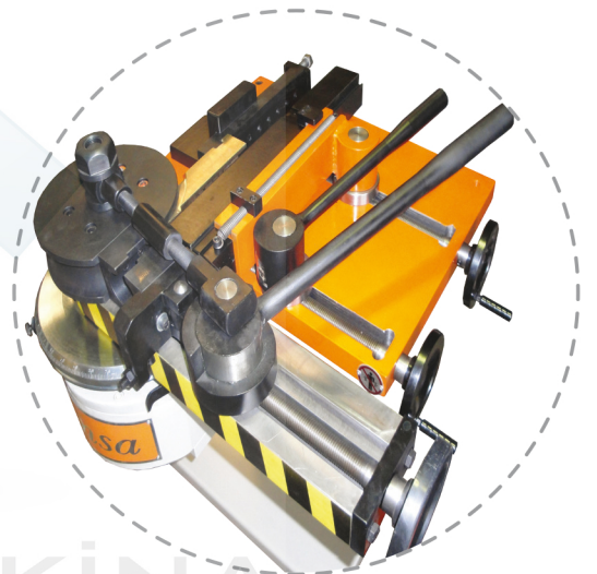
Bending Group and Support Group